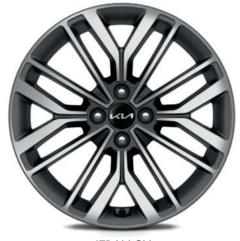
17" ALLOY (LX-T, GT Line & GT Line Plus)