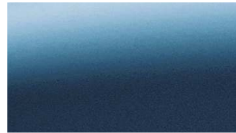
Deep Cerulean Blue