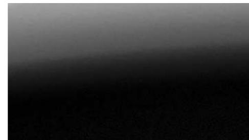
Aurora Black Pearl