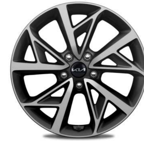
18" WHEELS (Available on HEV Deluxe & Premium models only)