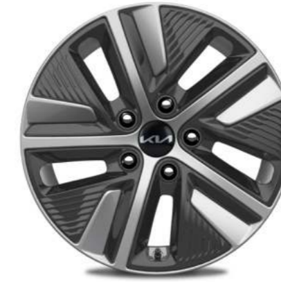
16" WHEELS (Available on HEV LX & LX Plus models, and all PHEV models)