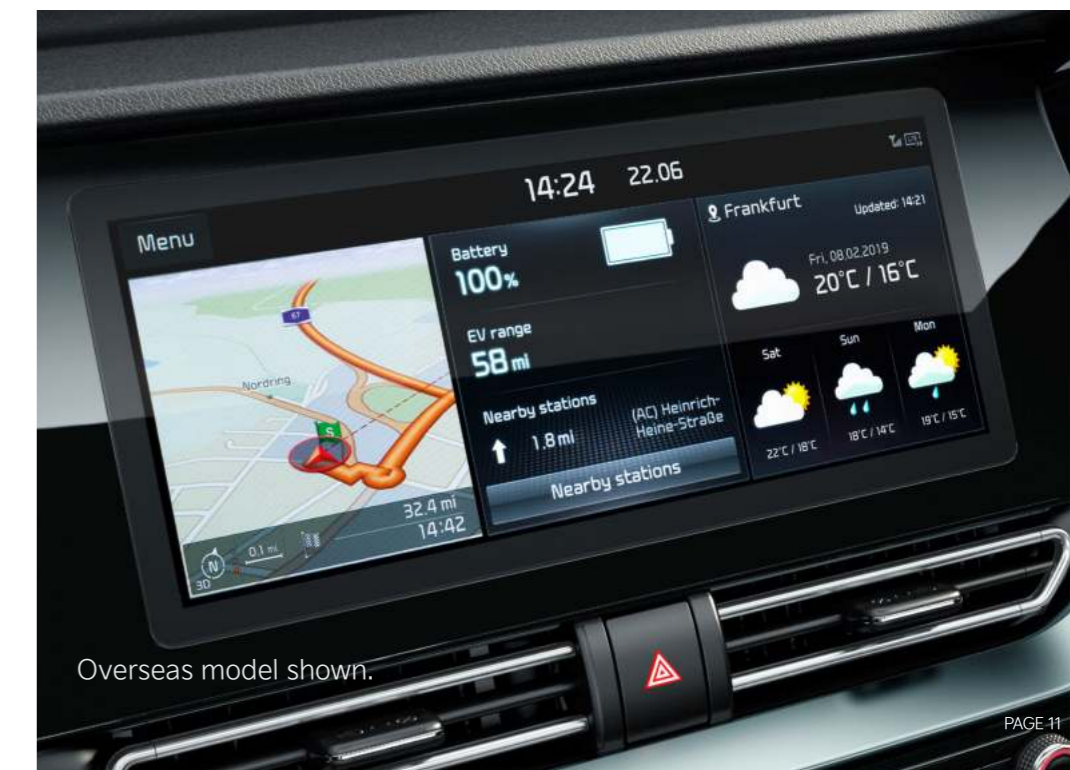
Overseas model shown.