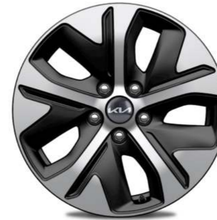
17" WHEELS (Available on EV models only)