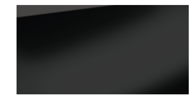
Aurora Black Pearl