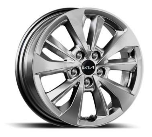
17" ALLOY (EX)