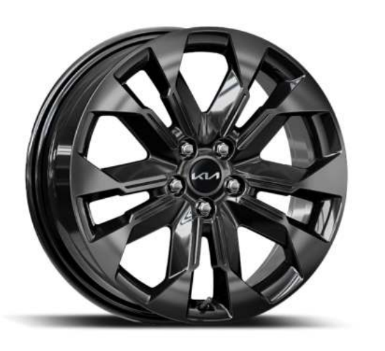
19" ALLOY - Black Finish (Premium in Ceramic Silver only)