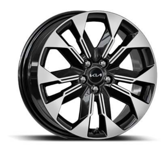
19" ALLOY - Machine Finished (Deluxe & Premium)