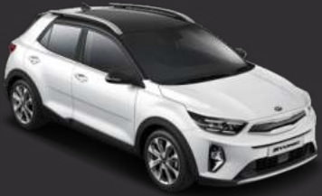
CLEAR WHITE / BLACK ROOF