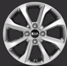
15" Alloy (LX)