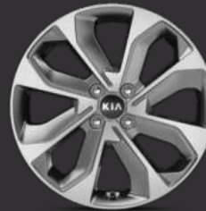
17" Alloy (Limited)