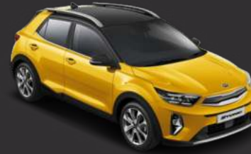
MIGHTY YELLOW / BLACK ROOF