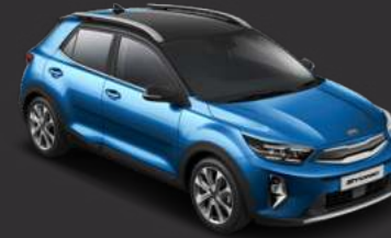
SPORTY BLUE / BLACK ROOF