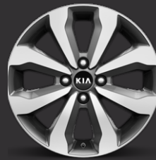
16" Alloy (EX)