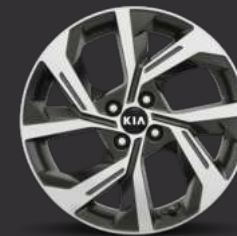
17" Alloy (GT Line / GT Line+)