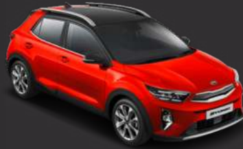
SIGNAL RED / BLACK ROOF