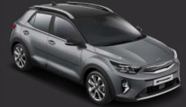
PERENNIAL GREY / BLACK ROOF