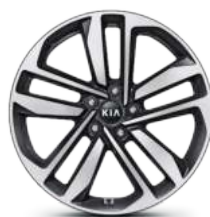
19" Alloy wheel (EX)