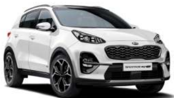
Snow White Pearl (GT Line)