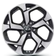
17" Alloy wheel (LX)