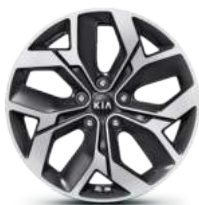
18" Alloy wheel (LX Plus)