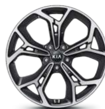
GT Line 19" Alloy wheel (GT Line)