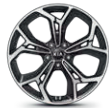
GT Line 19" Alloy wheel (GT Line)