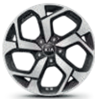
17" Alloy wheel (LX)