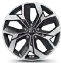
18" Alloy wheel (LX Plus)