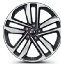
19" Alloy wheel (EX)