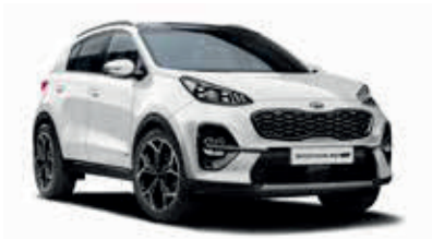
Snow White Pearl (GT Line)