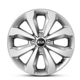
16" Alloy (EX)