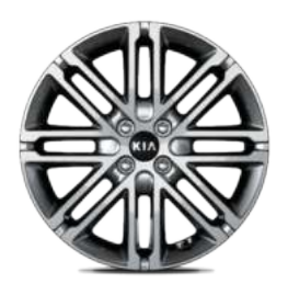
17" Alloy (LTD)