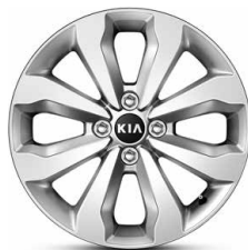
16" Alloy (EX)