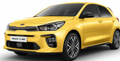
Mighty Yellow (GT Line and GT Line+)