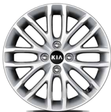
15" Alloy (LX)