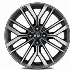
17" Alloy (GT Line and GT Line+)