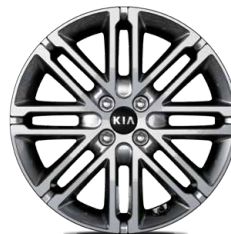
17" Alloy (LTD)