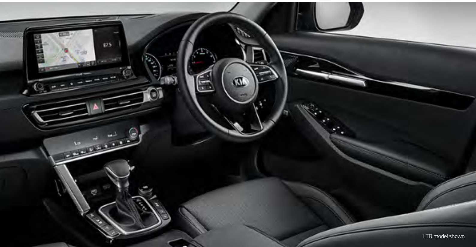
LTD model shown