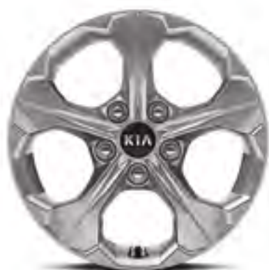
16" Alloy LX and LX PLUS