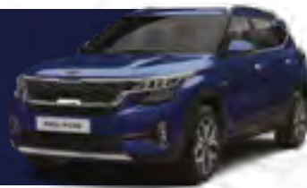
Dark Ocean Blue