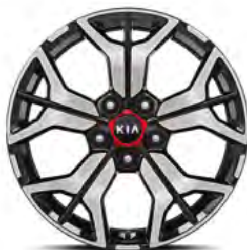
18" Alloy LTD

Two-tone colours are available at additional cost.