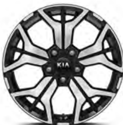
17" Alloy EX