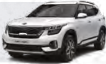
Snow White Pearl