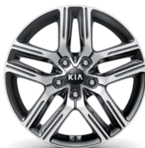
17" Alloy (EX)