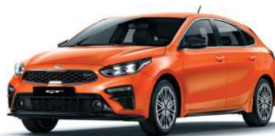
Orange Delight (GT)