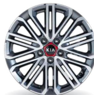
18" Alloy (GT)