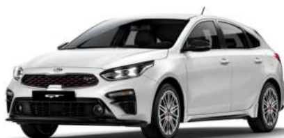
Snow White Pearl (GT)