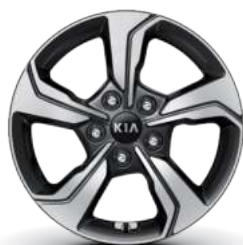
16" Alloy (SX & LX)