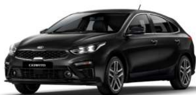
Aurora Black Pearl