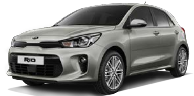
Urban Green (LX, EX, LTD)