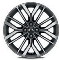
17" Alloy (GT Line)