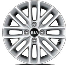
16" Alloy (EX)