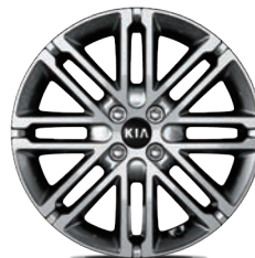
17" Alloy (LTD)