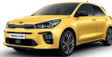
Spring Yellow (GT Line)