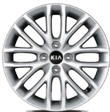
15" Alloy (LX)