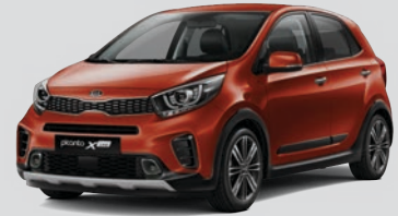
Pop Orange + Silver Accent