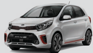
Clear White + Red Accent