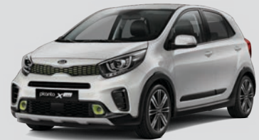
Clear White + Lime Accent