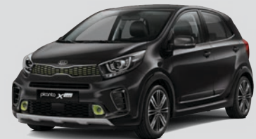
Aurora Black Pearl + Lime Accent