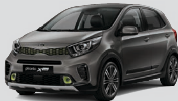
Titanium Silver + Lime Accent