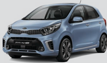
Celestial Blue + Silver Accent