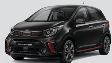
Aurora Black Pearl + Red Accent