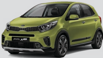
Lime Light + Silver Accent