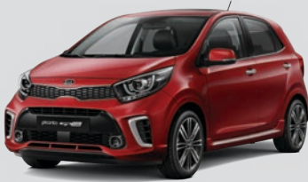
Shiny Red + Silver Accent