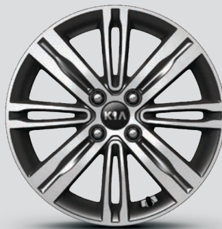
16" alloy wheel (GT Line & X Line)