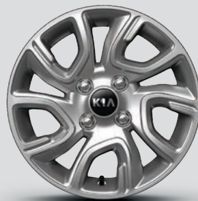
14" alloy wheel (LX)