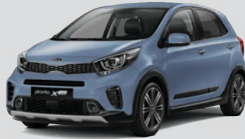
Celestial Blue + Silver Accent