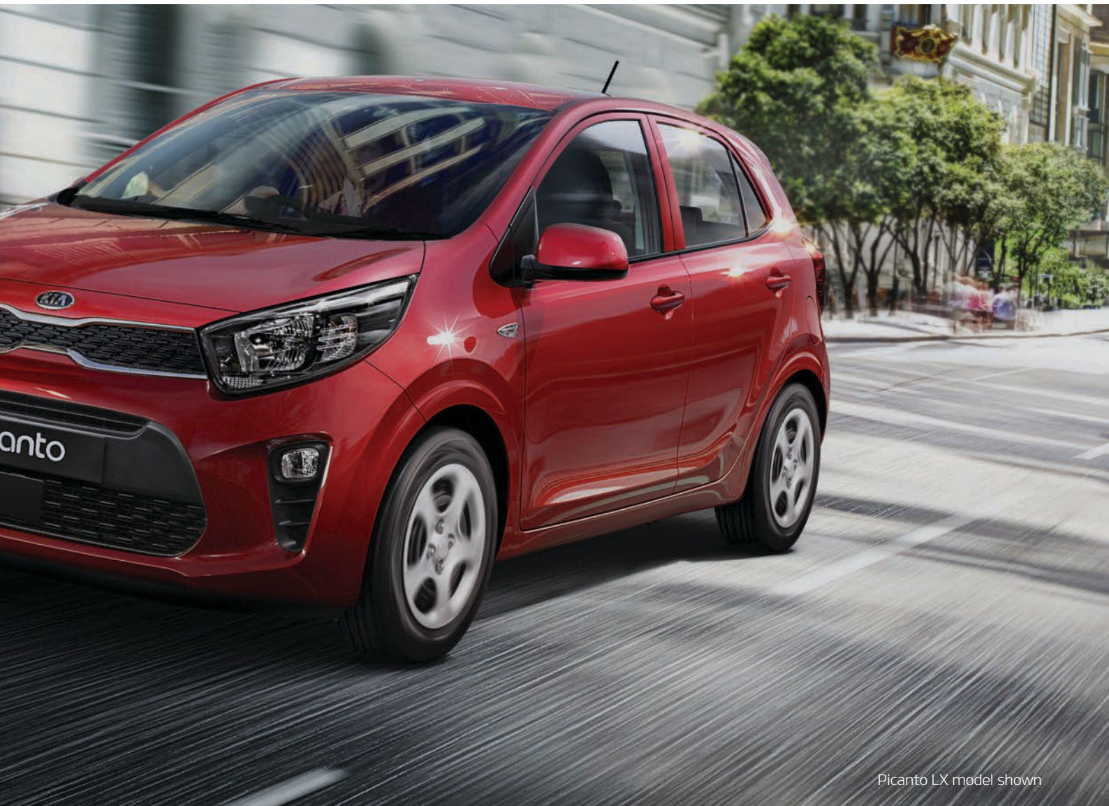
Picanto LX model shown