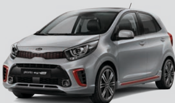
Sparkling Silver + Red Accent