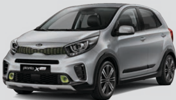
Sparkling Silver + Lime Accent