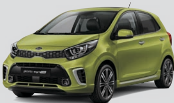
Lime Light + Silver Accent