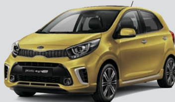
Honey Bee + Silver Accent