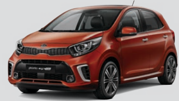
Pop Orange + Silver Accent