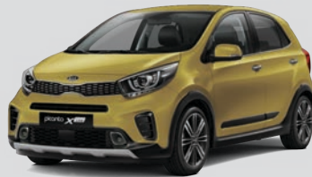
Honey Bee + Silver Accent