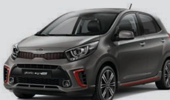
Titanium Silver + Red Accent