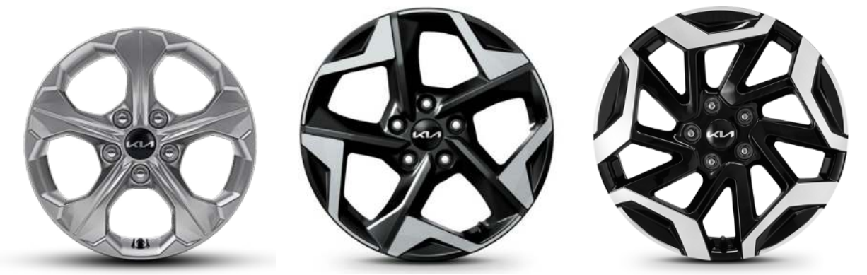
16" (Seltos LX)