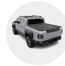
Electric Roller Cover