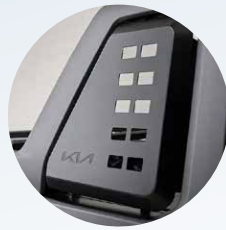
Sport Bar Kit