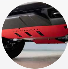
Steel Bash Plate