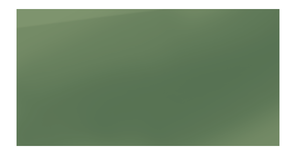
Jungle Wood Green (X-Line only)