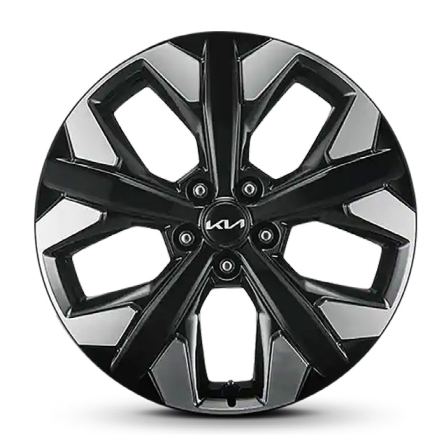
19" Alloy (X-Line)