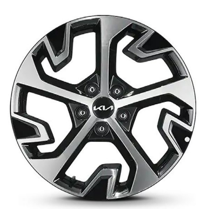
18" Alloy (Light HEV & LX Plus)