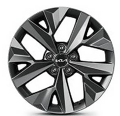
18" Alloy (Earth HEV)