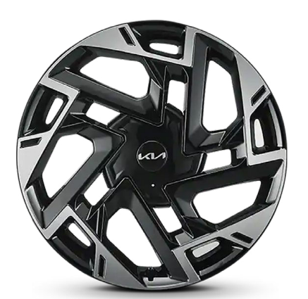
19" Alloy (Deluxe)