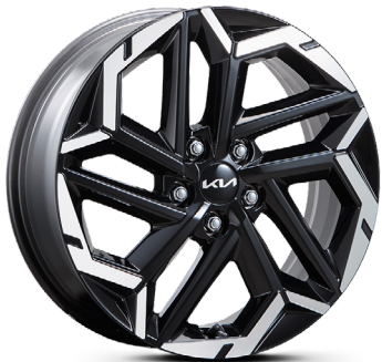
18" Alloy Machine Finished (Deluxe)