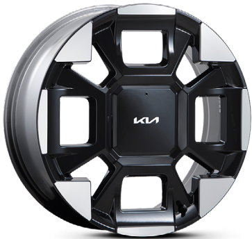
19" Alloy Machine Finished (Premium)