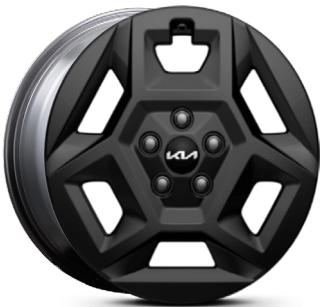
17" Alloy (EX)