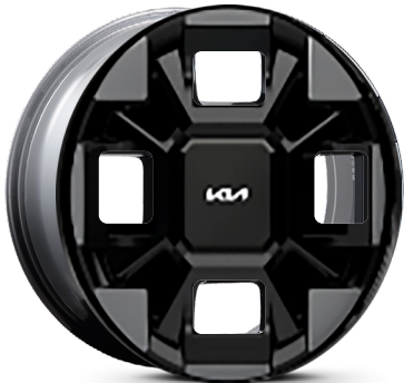
19" Alloy (Water HEV)