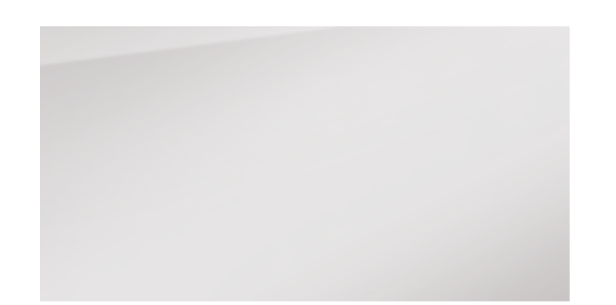
Clear White (LX & LX Plus only)