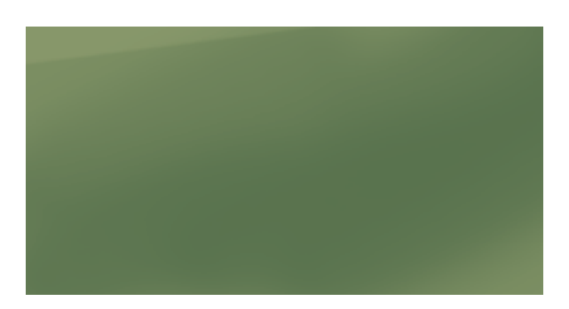
Jungle Wood Green (X-Line only)