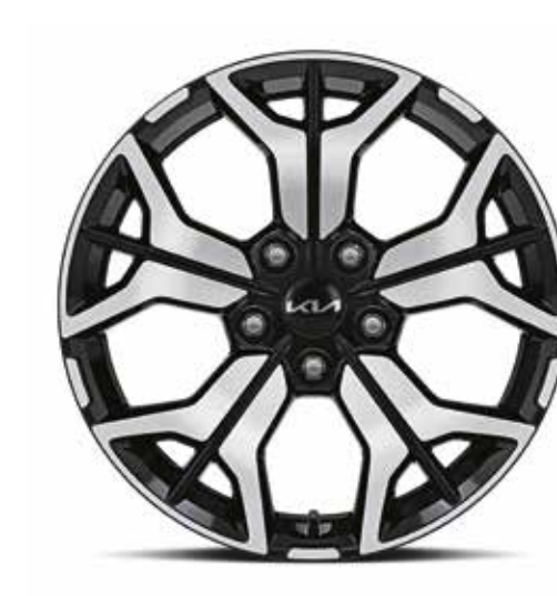
17" ALLOY (EX)

Available on LX, LX Plus, Limited and Limited AWD.