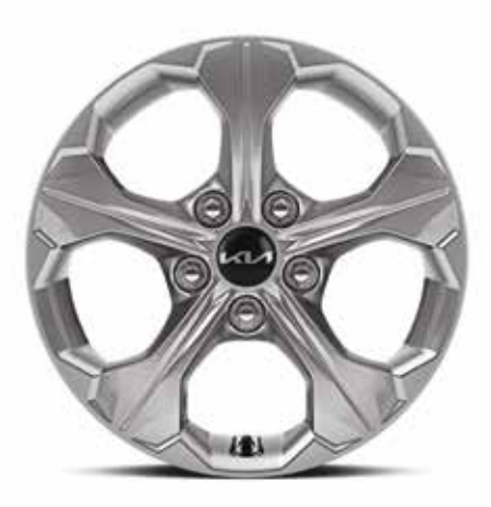
16" ALLOY (LX & LX Plus)