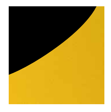
Starbright Yellow w. Black Roof

Available on LX, LX Plus, Limited and Limited AWD.