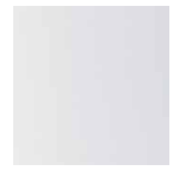
Snow White Pearl