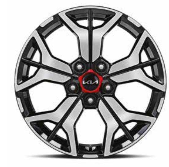
18" ALLOY (Limited & Limited AWD)