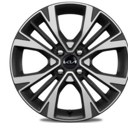
16" ALLOY (GT Line & X Line)