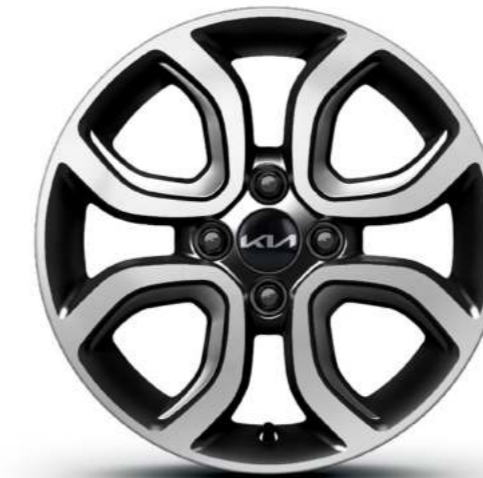
15" ALLOY (EX)