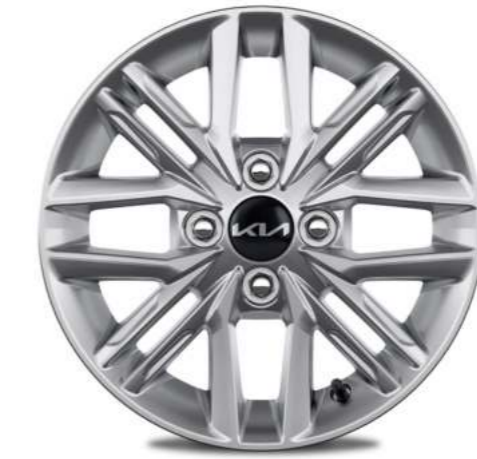
14" ALLOY (LX)