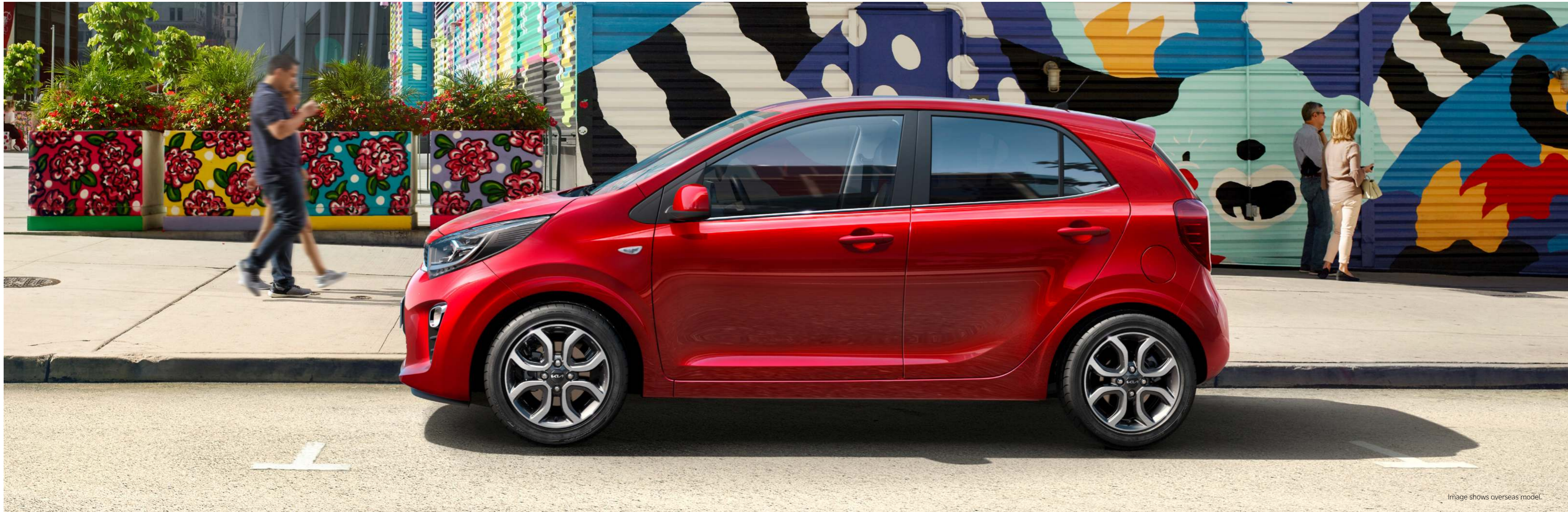
Image shows overseas model.