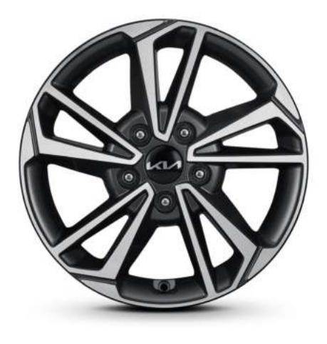
16" ALLOY (LX & LX Plus)