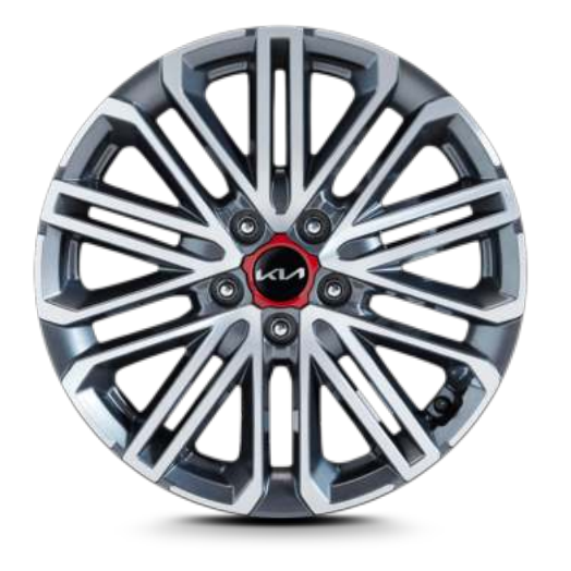
18" ALLOY (GT)