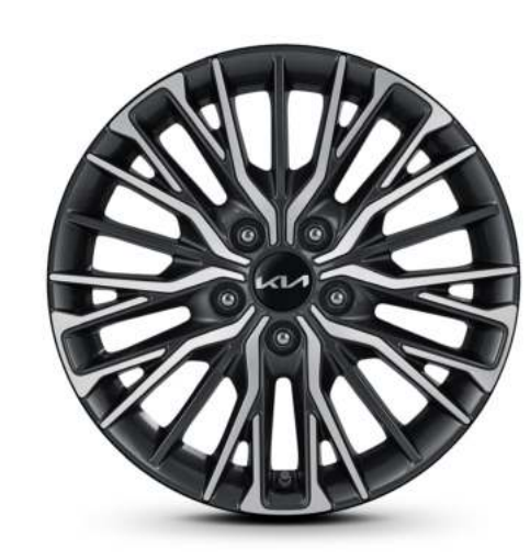
17" ALLOY (Deluxe)