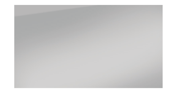
Snow White Pearl (GT model only)