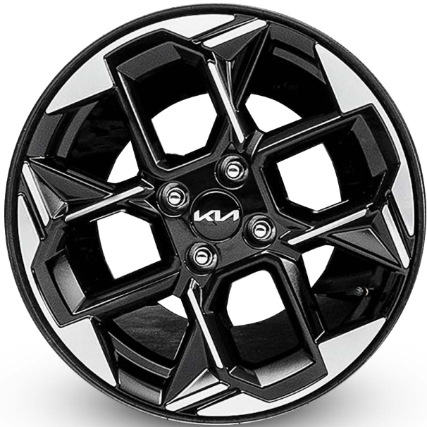
16" alloy (GT-Line)